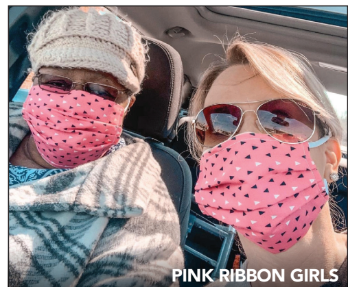
PINK RIBBON GIRLS